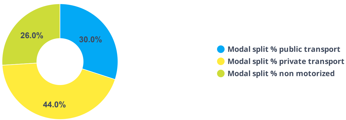
MODAL SPLIT - GOIÂNIA

“ The city has started the system in 1976 and now counts with 2 bus priority corridors consisting of 24 kilometers and benefiting 328,300 passengers every day. The average operational speed of the system is 17.8 km/h.