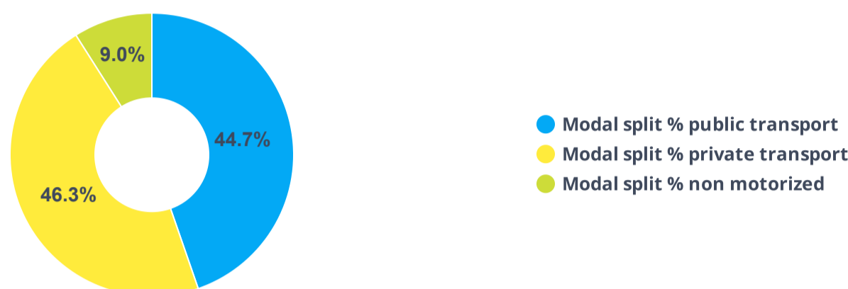
MODAL SPLIT - BUENOS AIRES

“ The city has started the system in 2011 and now counts with 9 bus priority corridors consisting of 54 kilometers and benefiting 1,419,000 passengers every day. The average operational speed of the system is 24,0 km/h.