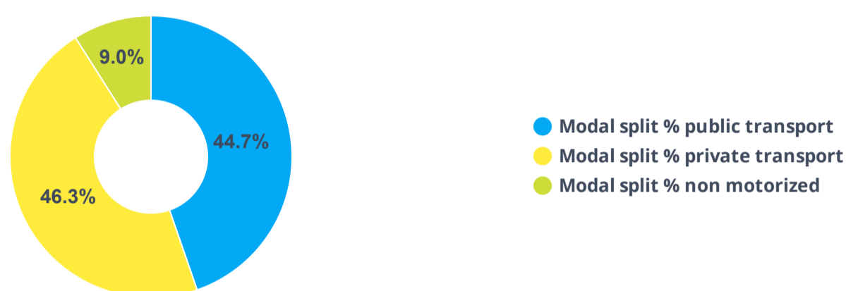
MODAL SPLIT - BUENOS AIRES

“ The city has started the system in 2011 and now counts with 8 bus priority corridors consisting of 54 kilometers and benefiting 1,419,000 passengers every day. The average operational speed of the system is 24,0 km/h.