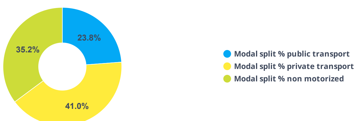
MODAL SPLIT - BELO HORIZONTE

“ The city has started the system in 1975 and now counts with 7 bus priority corridors consisting of 39 kilometers and benefiting 372,303 passengers every day. The average operational speed of the system is 17,6 km/h.