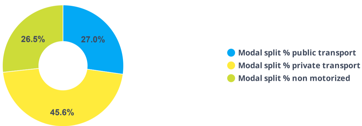
MODAL SPLIT - SÃO JOSÉ DOS CAMPOS

“ The city has started the system in 2022 and now counts with 1 bus priority corridors consisting of 22 kilometers and benefiting 22,000 passengers every day.